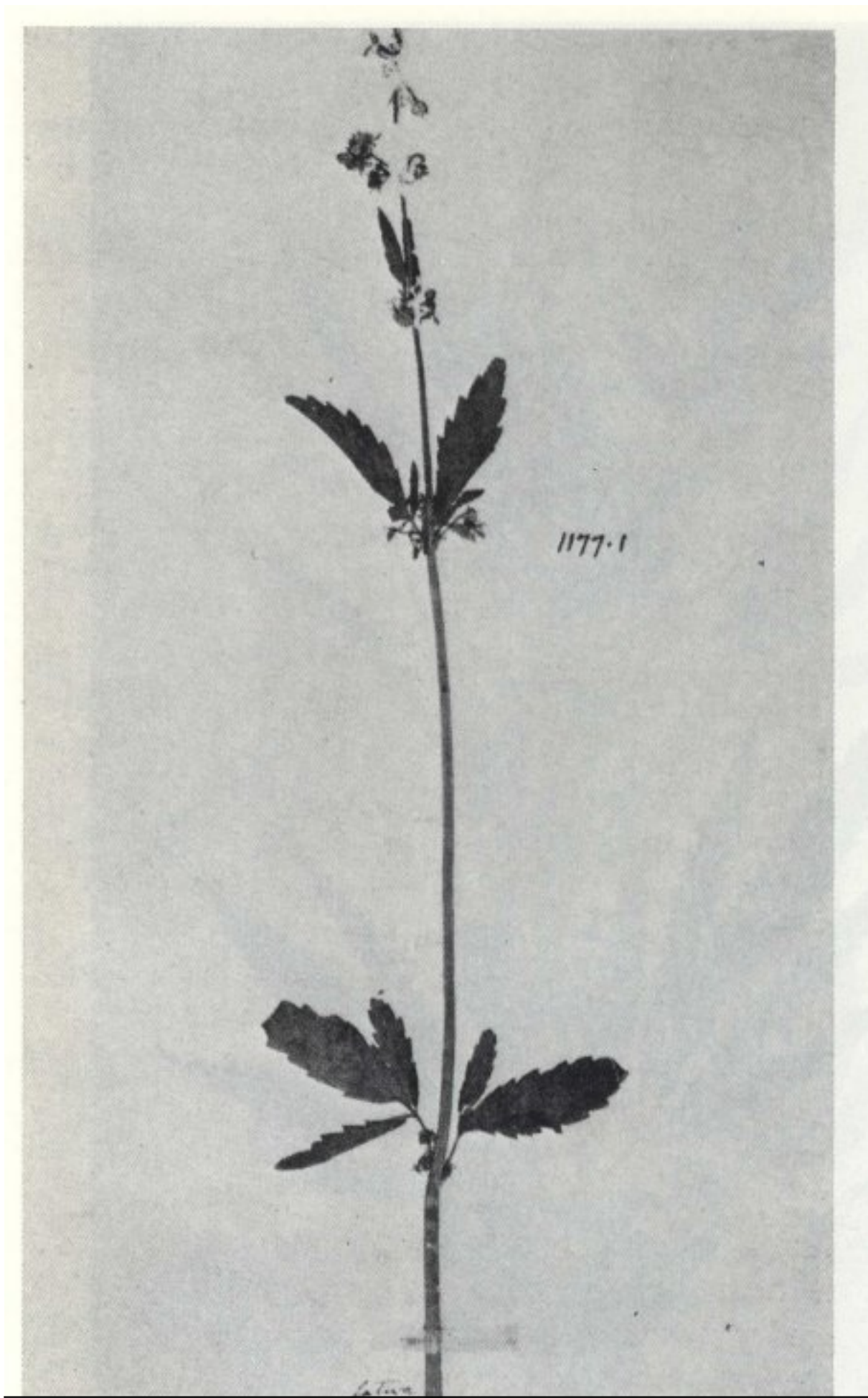
Plate 1. Specimen No. 1177.1 of Cannabis in the Linnean Herbarium