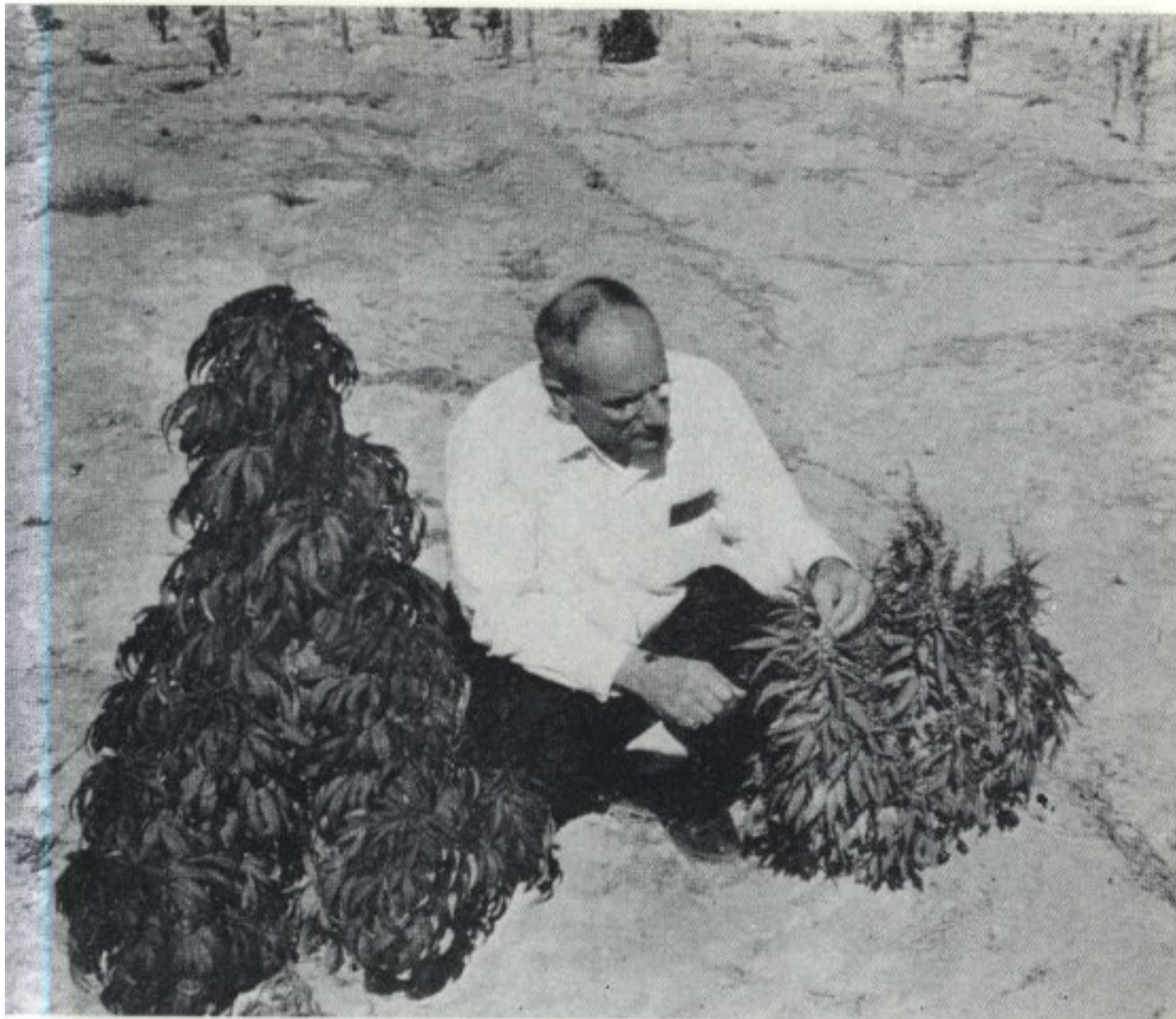
Plate 4. Cannabis indica (left: pistillate individual; right: staminate individual) in fields near Kandahar, Afghanistan. Pistillate plant: source of specimen R. E. Schultes 26505 (Econ. Herb. Oakes Ames)